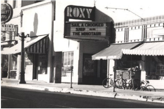
Roxy Theatre, ca 1961.